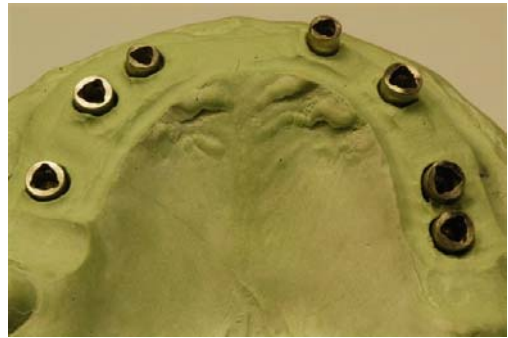
Exposed Abutment Replica